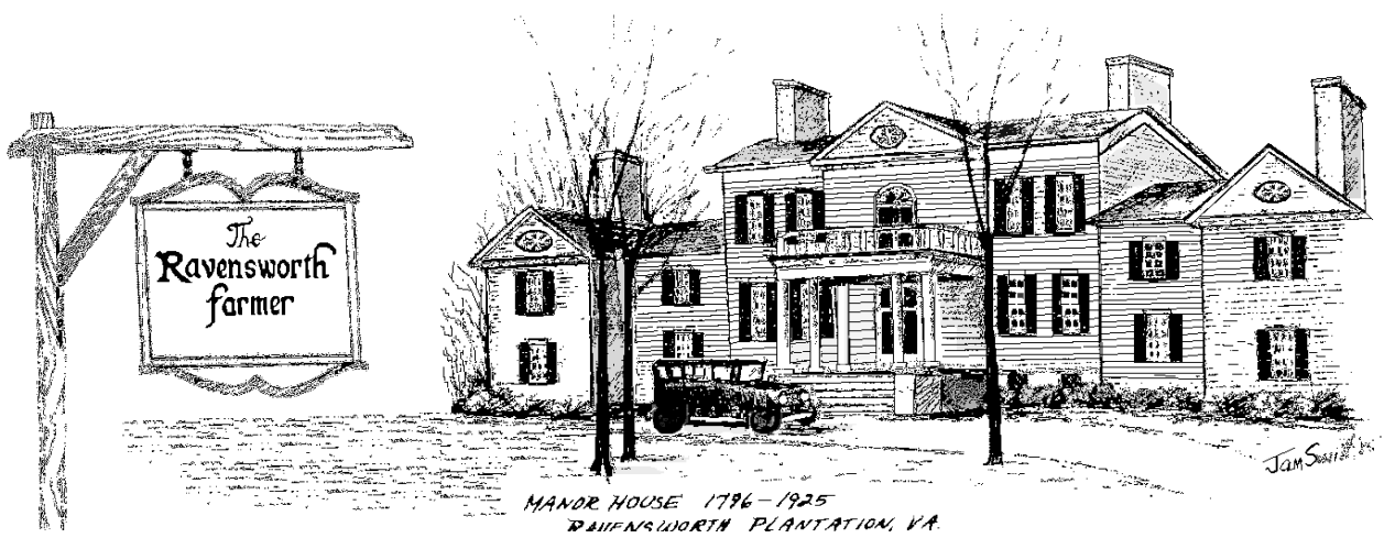
MANDOR HOUSE 1796-1925 RAVENSWORTH PLANTATION, VA.

The Official Publication of the Ravensworth Farm Civic Association, Inc. Springfield, Virginia