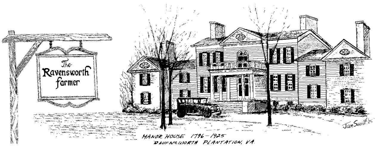
MANDR HOUSE 1796-1925 RAVENSWORTH PLANTATION, VA.

The Official Publication of the Ravensworth Farm Civic Association, Inc. Springfield, Virginia