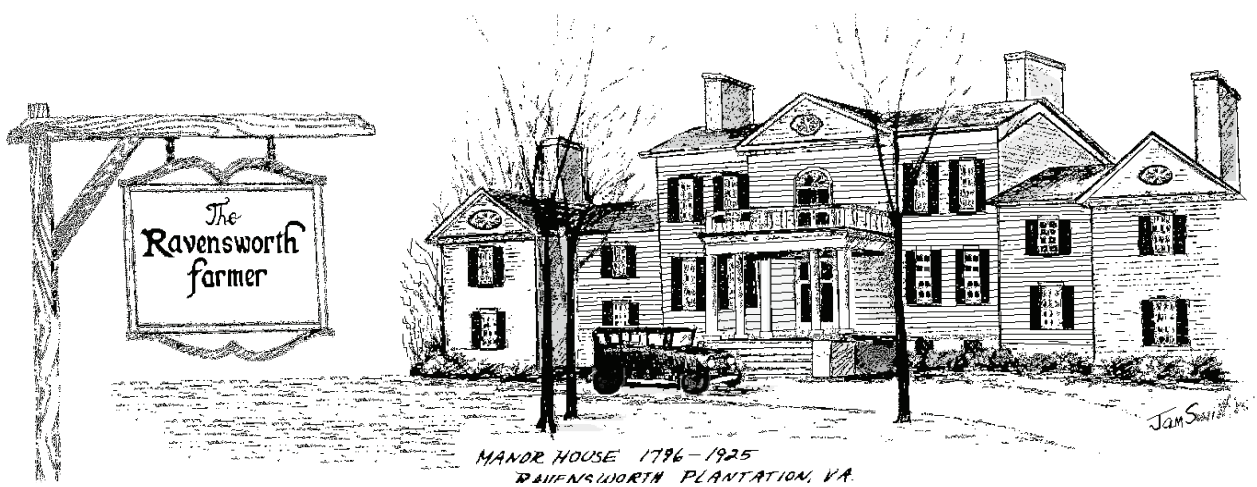
MANDR HOUSE 1796-1925 RAVENSWORTH PLANTATION, VA.

The Official Publication of the Ravensworth Farm Civic Association, Inc. Springfield, Virginia