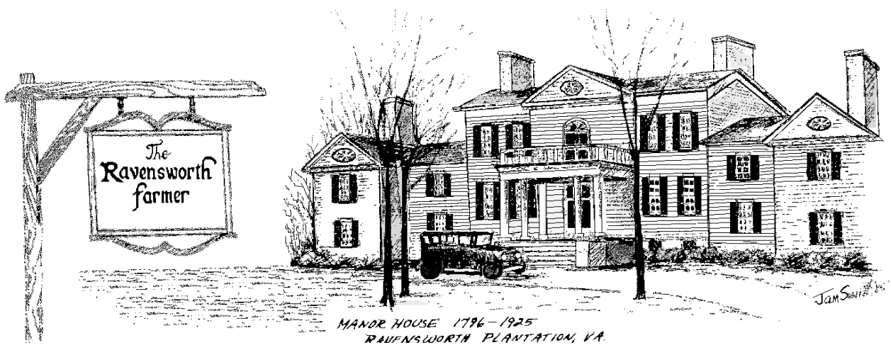
MANDR HOUSE 1796-1925 RAVENSWORTH PLANTATION, VA.

The Official Publication of the Ravensworth Farm Civic Association, Inc. Springfield, Virginia