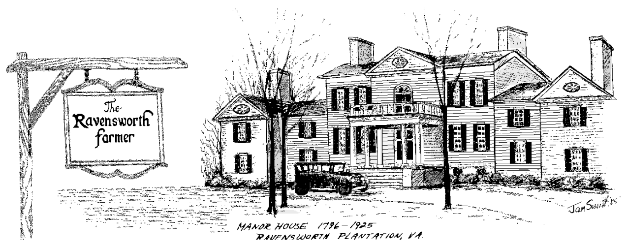
The Official Publication of the Ravensworth Farm Civic Association, Inc. Springfield, Virginia