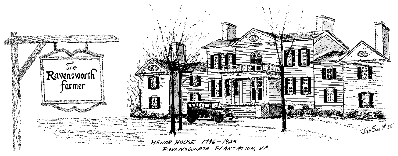
The Official Publication of the Ravensworth Farm Civic Association, Inc. Springfield, Virginia