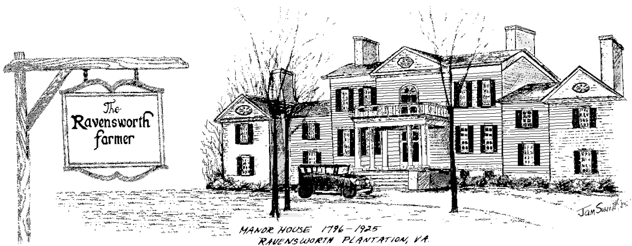
MANDR HOUSE 1796-1925 RAVENSWORTH PLANTATION, VA.

The Official Publication of the Ravensworth Farm Civic Association, Inc. Springfield, Virginia