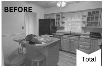
Total cost: $6,200