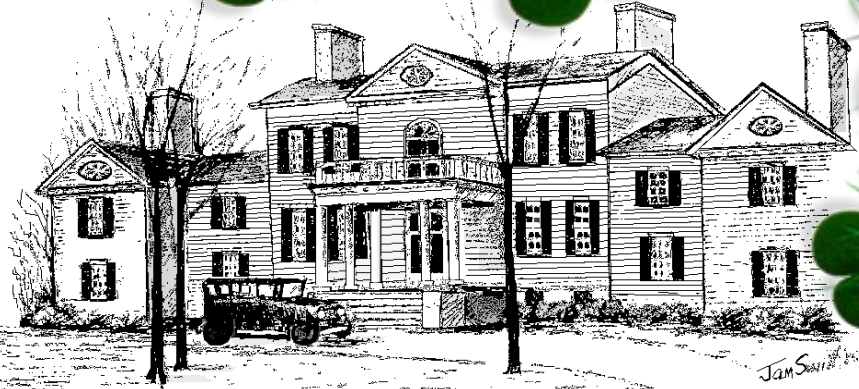
MANDR HOUSE 1796-1925 RAVENSWORTH PLANTATION, VA.

The Official Publication of the Ravensworth Farm Civic Association, Inc. Springfield, Virginia