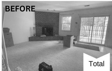
Total cost: $1,100

Call us for a private consultation on how to sell AS-IS and SAVE $$$ on any updates. Our 45-minute meeting will save you thousands of $$$. 703-952-3425