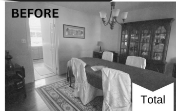
Total cost: $900