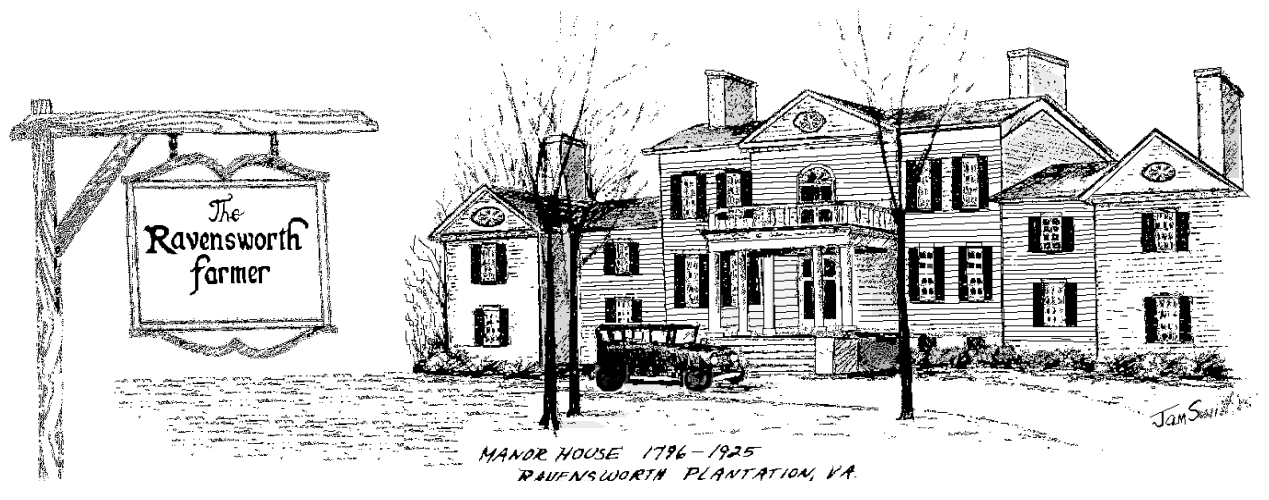
The Official Publication of the Ravensworth Farm Civic Association, Inc. Springfield, Virginia