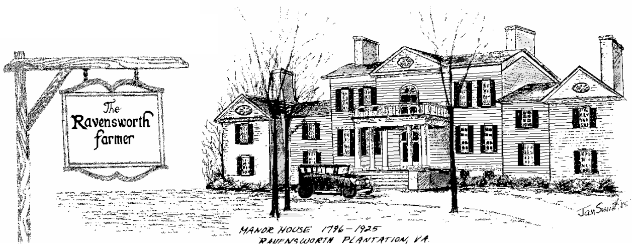
MANDR HOUSE 1796-1925 RAVENSWORTH PLANTATION, VA.