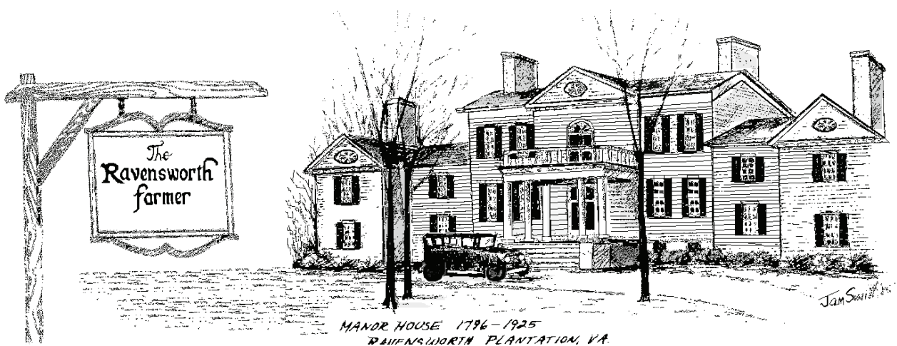
MANDOR HOUSE 1796-1925 RAVENSWORTH PLANTATION, VA.

The Official Publication of the Ravensworth Farm Civic Association, Inc. Springfield, Virginia