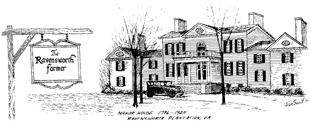
MANDR HOUSE 1796-1925 RAVENSWORTH PLANTATION, VA.

The Official Publication of the Ravensworth Farm Civic Association, Inc. Springfield, Virginia