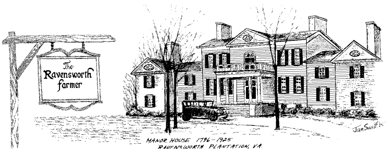
MANDR HOUSE 1796-1925 RAVENSWORTH PLANTATION, VA.

The Official Publication of the Ravensworth Farm Civic Association, Inc. Springfield, Virginia