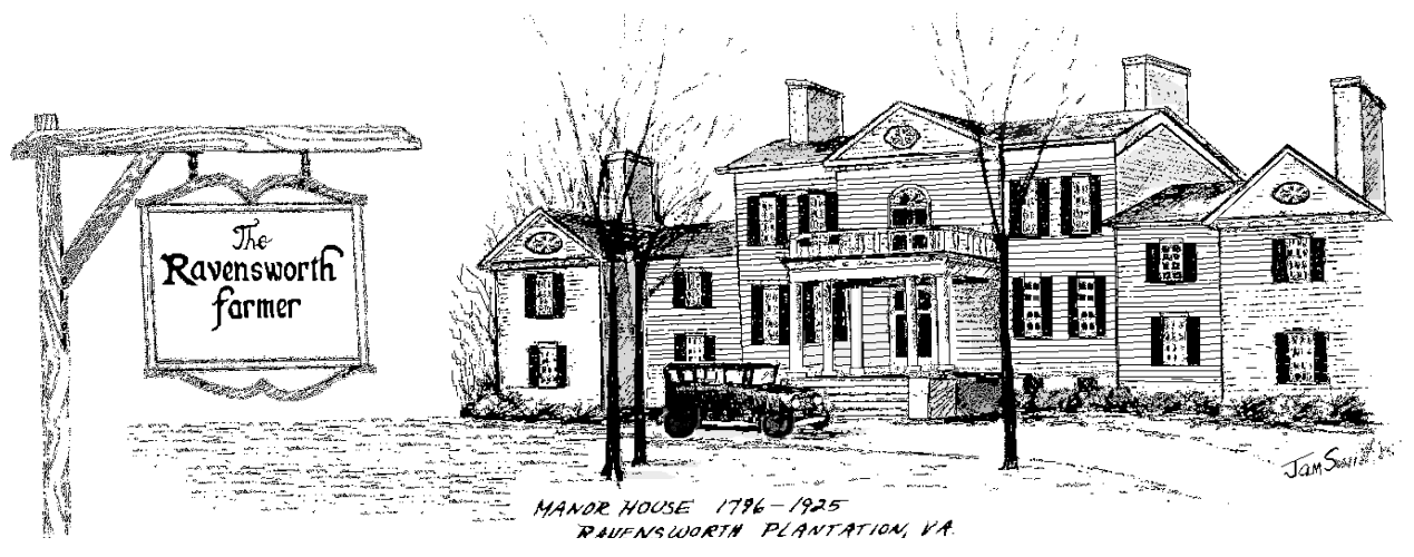
The Official Publication of the Ravensworth Farm Civic Association, Inc. Springfield, Virginia