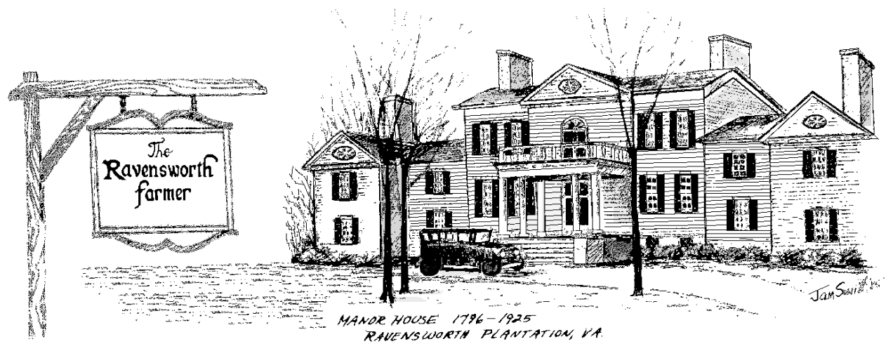
The Official Publication of the Ravensworth Farm Civic Association, Inc. Springfield, Virginia