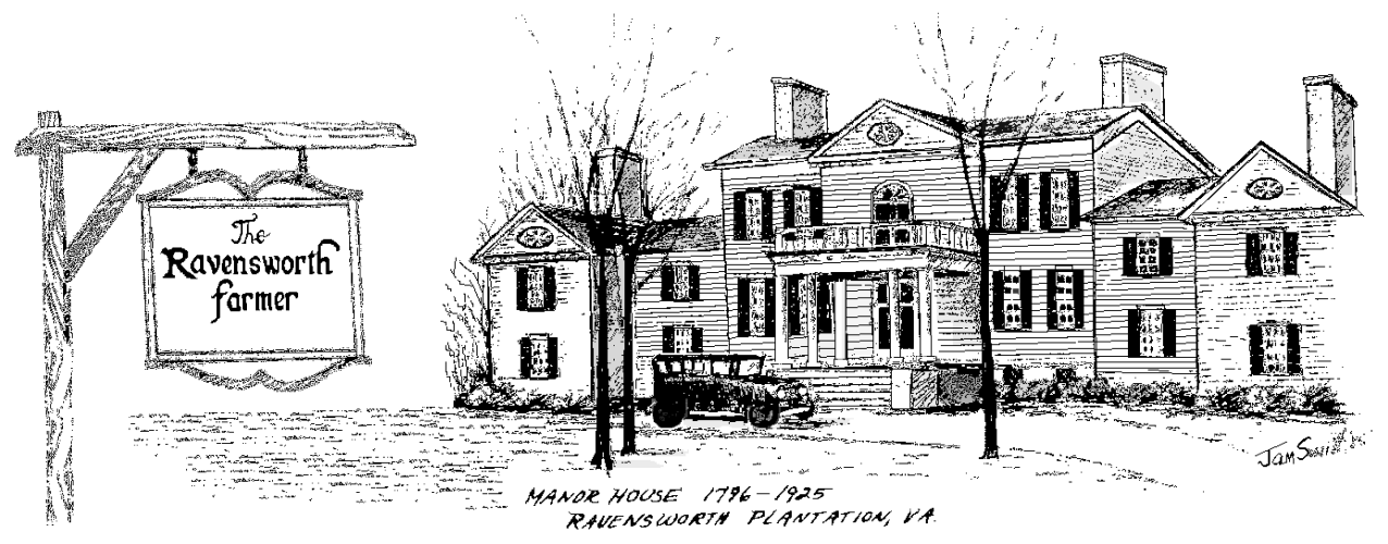
The Official Publication of the Ravensworth Farm Civic Association, Inc. Springfield, Virginia