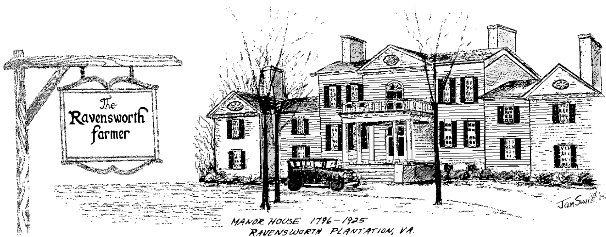
MANDR HOUSE 1796-1925 RAVENSWORTH PLANTATION, VA.

The Official Publication of the Ravensworth Farm Civic Association, Inc. Springfield, Virginia